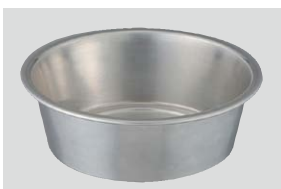
Aluminum Bucket Ø350 B2081-12-001