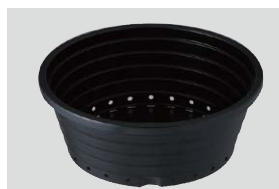
Receptacle Tray Ø350 Flat type (Option) B2081-12-008

★ An optional flat type receptacle tray is recommended for very sensitive delicate workpieces requiring very careful handling allowing absolutely no damage at all. For the maximum safety of such sensitive workpieces, avoid double or triple layers of workpieces accumulation.