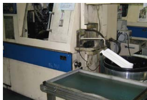
SPA-500H installed at D factory

The most recommended model for highest safety protection of workpieces. Ideal when lathes emitter height is >750mm and up to 850mm from the floor.