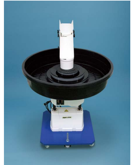
SPA-500/Φ700 with 3-tier receptacle tray