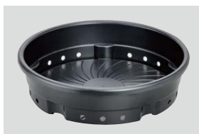
Receptacle Tray Φ500 B0014-06-013