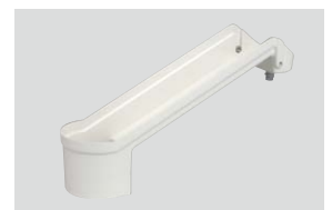
Collection Ramp B0014-00-023

A 3-tier-stage receptacle tray can hold about 3 times as many as workpieces compared to the standard tray, and run length can be extended to 15~16 hours. (workpiece size Φ16mm,L32.8mm, processing time 95 seconds)