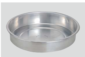
Aluminum Bucket Φ500 B0014-06-001