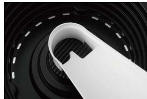
Collection Ramp End Circle where a workpiece touchdowns

The compact model with high profile reach.