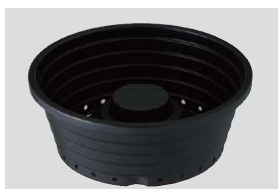
Receptacle Tray Ø350 with 3-tier- stage (Standard) B2081-12-003