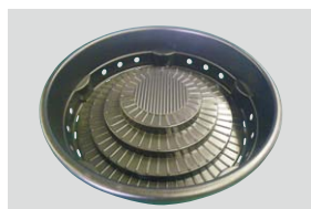
Receptacle Tray Φ500 with 3-tier-stage B0014-06-303

A 3-tier-stage receptacle tray can hold about 3 times as many as workpieces compared to the standard tray, and run length can be extended to 15~16 hours. (workpiece size Φ16mm,L32.8mm, processing time 95 seconds)