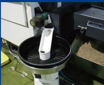
SPA-500 installed at B factory