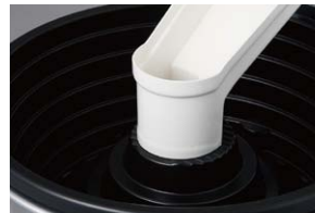
Properly seated Collection Ramp end and the receptacle tray (90 degree)