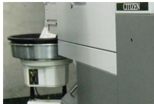
SPA-500 installed at C factory

Ario Techno is specialized in processing super high precision metal parts and therefore a user of various types of CNC Automatic Lathe Machines. Our long-time headaches have been dents and scratches on works caused by accidental collision of works when works are being collected and dropped, piled up in the conventional container as they come out from the lathe machine carried by the conveyor belt. How to prevent dents and scratches, and to minimize the loss, to cut the cost, and to improve work efficiencies enabling night time unattended operations safely.....we've gone through many tries and many samples, improvements after improvements, and here they are from the Team Ario, Super Arios !