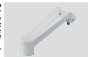
Collection Ramp B2081-10-003

★ An optional flat type receptacle tray is recommended for very sensitive delicate workpieces requiring very careful handling allowing absolutely no damage at all. For the maximum safety of such sensitive workpieces, avoid double or triple layers of workpieces accumulation.