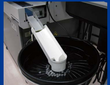
SPA-500H installed at A factory